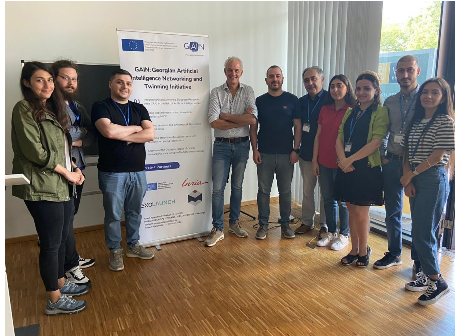
EXOLAUNCH Training, TU Berlin (21-26 August, 2023).